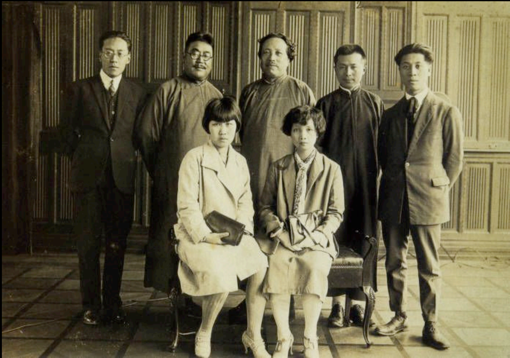
Pan Yuliang [front, left] with eminent members of Shanghai literary and artistic circles. 1930. Photograph; 10.7 x 15.2 cm.