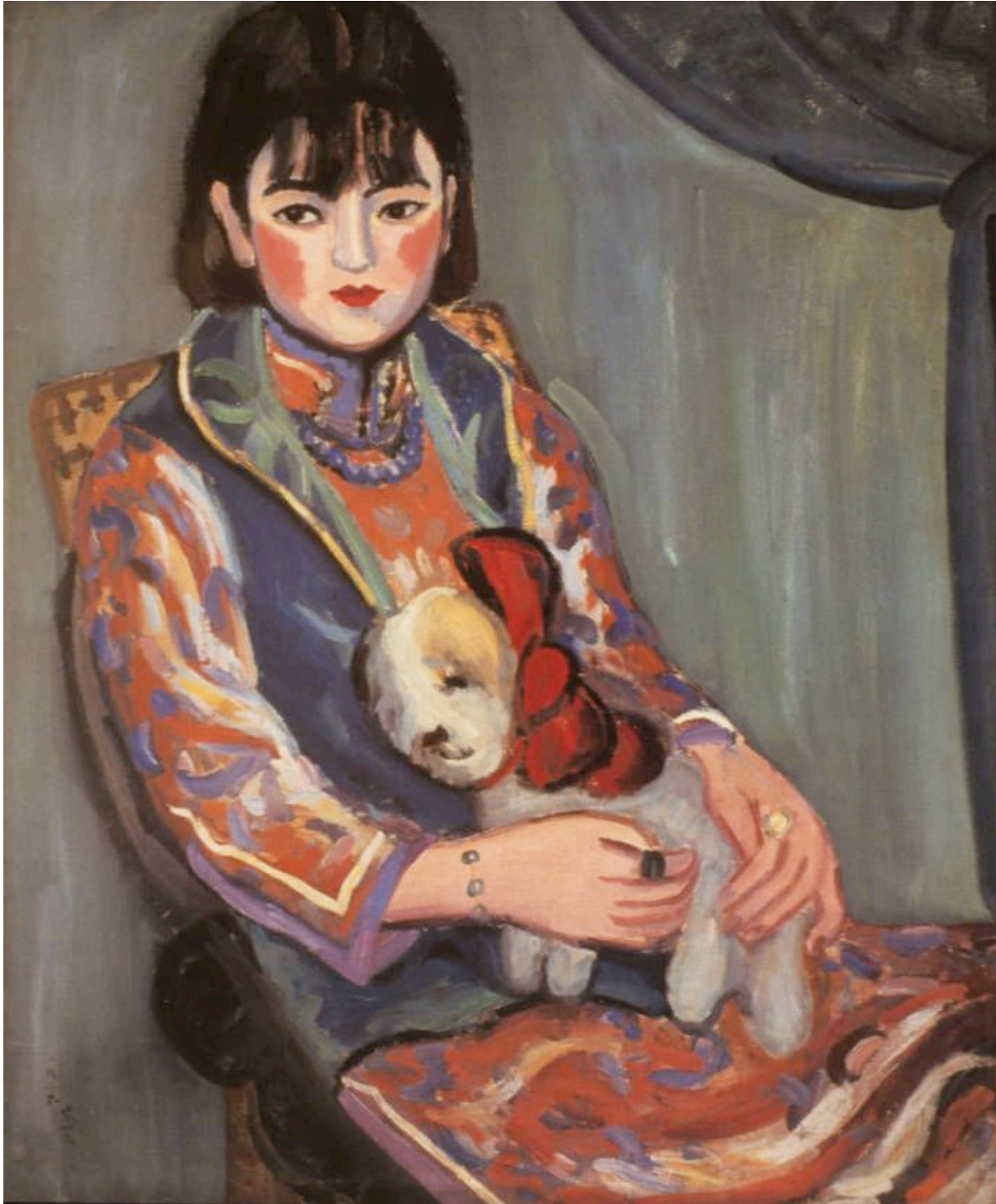
Guan Zilan (1903-1986). Portrait of Miss L. 1929. Oil on canvas; 90 x 75 cm Chinese National Art Gallery, Beijing