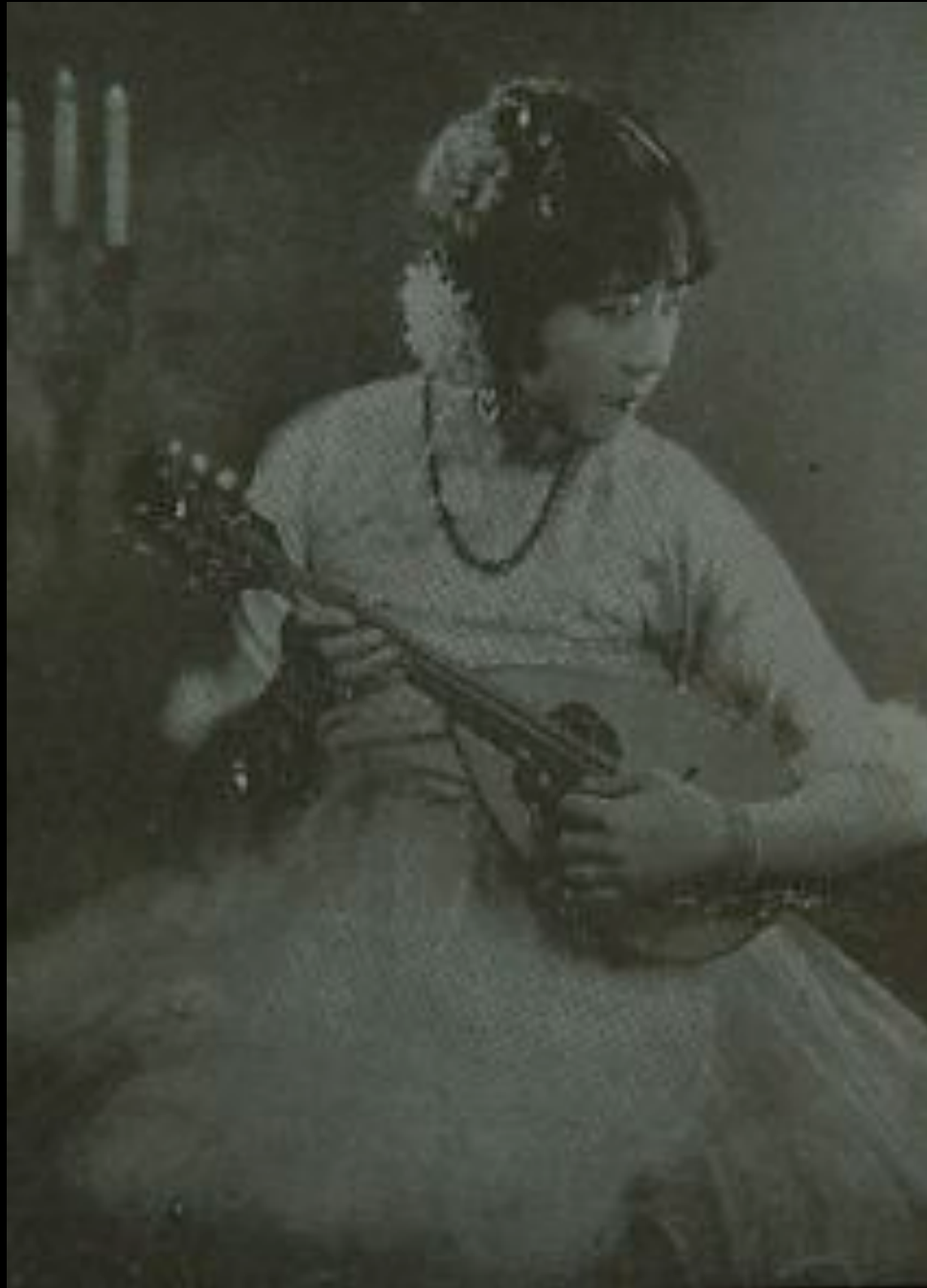
Portrait of Guan Zilan