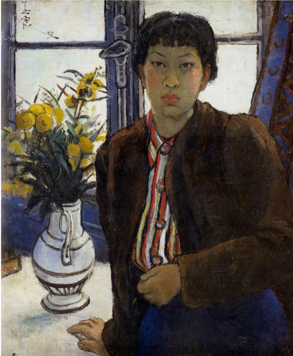
PAN YULIANG [Chinese artist, 1895-1977]. Self Portrait . 1945. Oil on canvas; 73.5 x 60 cm. National Art Museum of China, Beijing