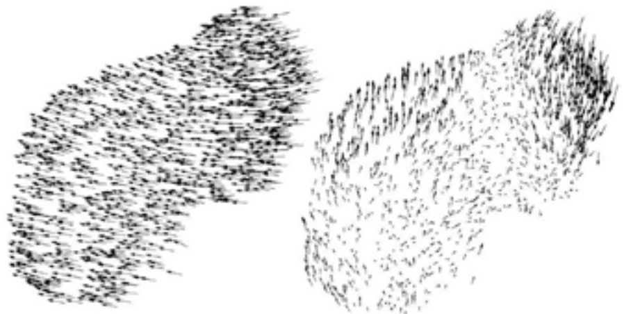
Analysis of starling velocities reveals a pattern of correlations extending across the entire flock. At left are vectors representing bird velocities; at right the flock's mean velocity has been subtracted from each vector, leaving fluctuations about the mean. (The fluctuations are actually much smaller than the velocities; the vectors have been rescaled for clarity.) The fluctuation vectors necessarily sum to zero, since the net motion of the flock has been subtracted; thus in some regions the prevailing direction is up, elsewhere it is down, and so on. The scale of these regions is comparable to the size of the flock, which indicates that velocities are correlated throughout the group. (Reproduced from Cavagna et al., Proceedings of the National Academy of Sciences of the U.S.A. 107:11865–11870.)

The findings of the STARFLAG program support the existing theoretical framework—the basic idea that flocks are held together by local interactions—but the results have also brought some surprises. For example, it turns out that the overall shape of starling flocks is not what it appears to be. To a casual observer, most flocks look globular; they appear to be deformed but fully rounded spheres or cylinders. But the