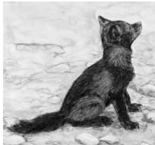
Figure 7. Changes in the foxes' coat color were the first novel traits noted, appearing in the eighth to tenth selected generations. The expression of the traits varied, following classical rules of genetics. In a fox homozygous for the Star gene, large areas of depigmentation similar to those in some dog breeds are seen ( top ). In addition some foxes displayed the brown mottling seen in some dogs, which appeared as a semirecessive trait.

tion. Fur farmers have tried for decades to breed foxes that would reproduce more often than annually, but all their attempts have failed.