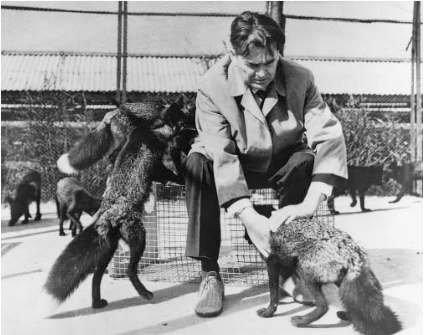
Figure 1. In the late 1950s, the Russian geneticist Dmitry K. Belyaev began a decades-long effort to breed a population of tame foxes. Belyaev, then director of the Institute of Cytology and Genetics of the U.S.S.R. (now Russian) Academy of Sciences in Novosibirsk, Siberia, hoped to show that physical and morphological changes in domestic animals such as dogs could have resulted from selection for a single behavioral trait, friendliness toward people. Fourteen years after his death, the experiment continues, and the results appear to support Belyaev's hypothesis.

that might well explain why different animals would respond in similar ways when subjected to the same kinds of selective pressures.