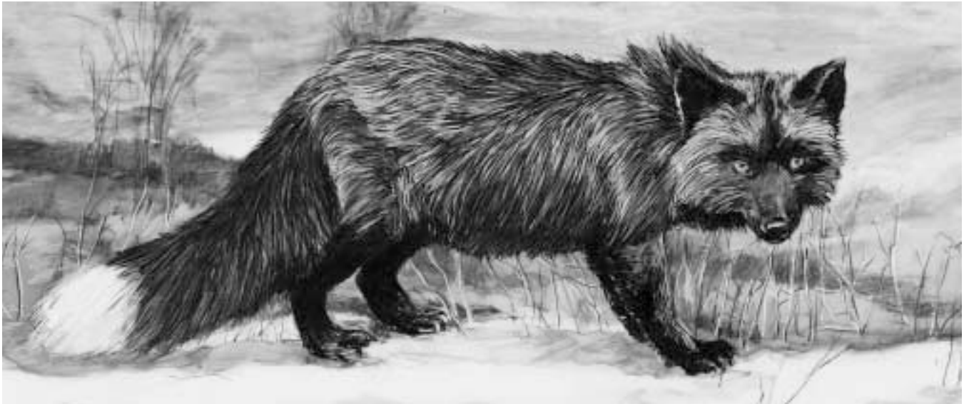
Figure 4. In typical silver foxes, such as those in the founding population of Belyaev's breeding experiment, ears are erect, the tail is low slung and the fur is silver-black, save for the tip of the tail. (All drawings of foxes were made from the author's photographs.)

tion, snarling fiercely at one another as they seek the favor of their human handler. Over the years several of our domesticated foxes have escaped from the fur farm for days. All of them eventually returned. Probably they would have been unable to survive in the wild.