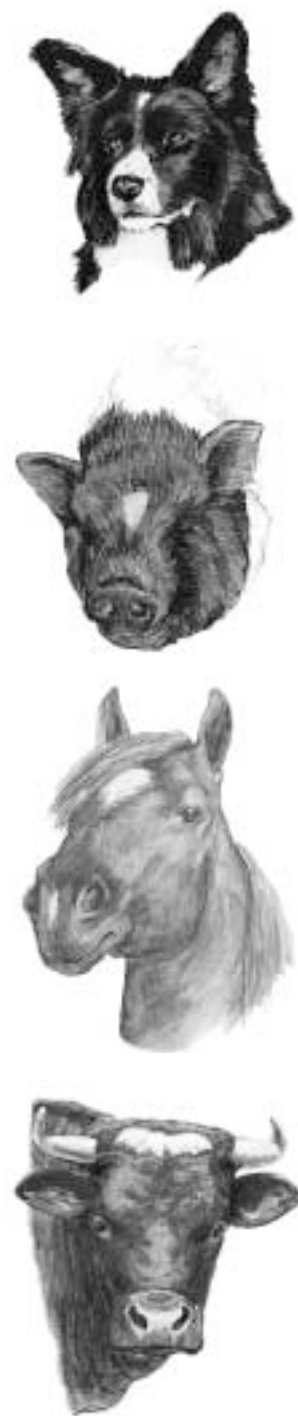
Figure 3. Piebald coat color is one of the most striking mutations among domestic animals. The pattern is seen frequently in dogs (border collie, top right), pigs, horses and cows. Belyaev's hypothesis predicted that a similar mutation he called Star , seen occasionally in farmed foxes, would occur with increasing frequency in foxes selected for tamability. The photograph above shows a fox in the selected population with the Star mutation.

ging their tails and whining. In the sixth generation bred for tameness we had to add an even higher-scoring category. Members of Class IE, the "domesticated elite," are eager to establish human contact, whimpering to attract attention and sniffing and licking experimenters like dogs. They start displaying this kind of behavior before they are one month old. By the tenth generation, 18 percent of fox pups were elite; by the 20th, the figure had reached 35 percent. Today elite foxes make up 70 to 80 percent of our experimentally selected population.