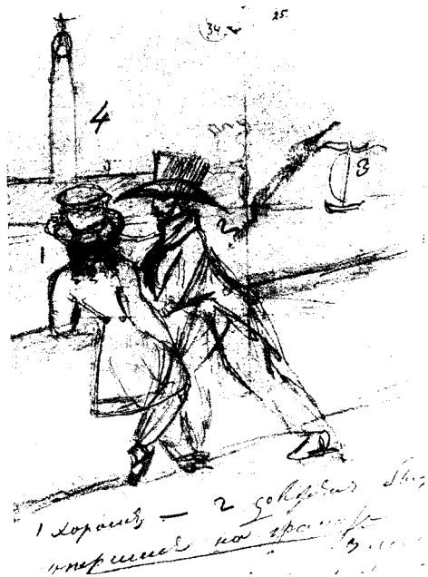
Рисунок Пушкина: автор с Онегиным.