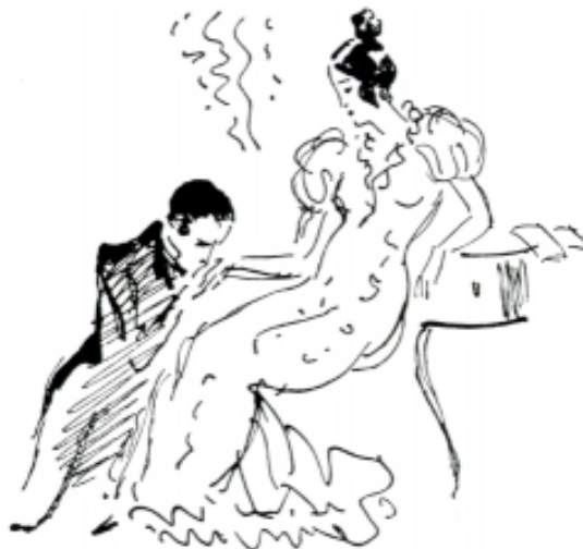
Глава 8. Иллюстрация художника Н.Кузьмина

Final papers or take-home finals are due on Monday, May 10 , at noon, in the instructor's office. Electronic submissions are discouraged.